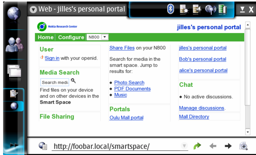
Fig. 1. Screenshot of the Smart Space portal running on a Nokia N800

discovering all registered search services in the smart space and collecting the results. The Oulu Mall portal that is listed in the portal list is a server with applications and services specific to the Oulu Mall public smart space. The idea is that when in this mall, users can interact with services such as a mall directory and a what's near feature that make use of the indoor position service available from their own device to provide an experience that is customized to the user and his/her context and location.